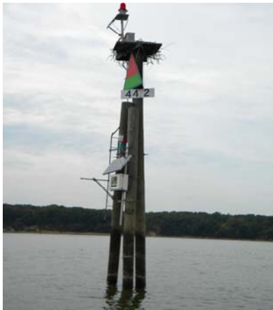
Highland Light real-time monitoring platform

In 2009, the National Science Foundation awarded a $6 million grant to Kentucky and Montana to support an advanced “cyberinfrastructure” project that includes a combination of hardware, software, networking, data storage, computational modeling and human resources. The grant provides end-to-end processes from water-quality sensors in