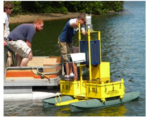
Graduate students launch the first water quality monitoring buoy, Pieces I

For years, the Station’s connection to the outside world has been a very slow T-1 line. As part of the VOEIS grant, we are now hooked up to an optical fiber network that gives us a vastly greater bandwidth and allows us to stream data and pictures for research and education. Also the grant provided for significant upgrades to our data management systems through purchase of an IBM blade center.