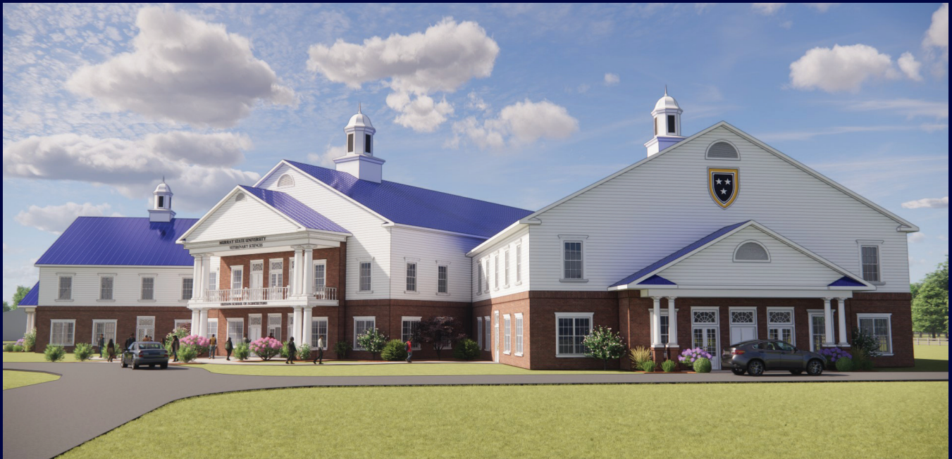
Preliminary rendering of Murray State University's new $60 million Veterinary Sciences Building. Appropriation secured in the 2024 Legislative Session.