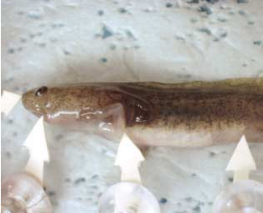
Fig. 3: Left-side digital image of a larval tiger salamander, Ambystoma tigrinum . Arrows show the position of characters used in morphometric analysis. These traits are (left to right): nares, corner of the jaw, posterior edge of front limb, anterior edge of hind limb.