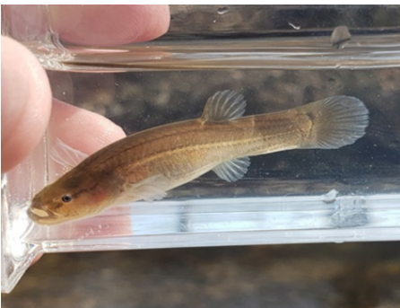
Photo 3. End result of tagging practice